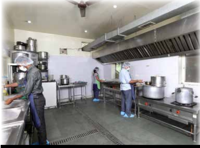
Image: Pakshala (food preparation house) for students' meal in SVAV campus

The Mid-Day Meal Programme have several key benefits. First, this meal is an important source of nutrition for many children who come from economically deprived families.