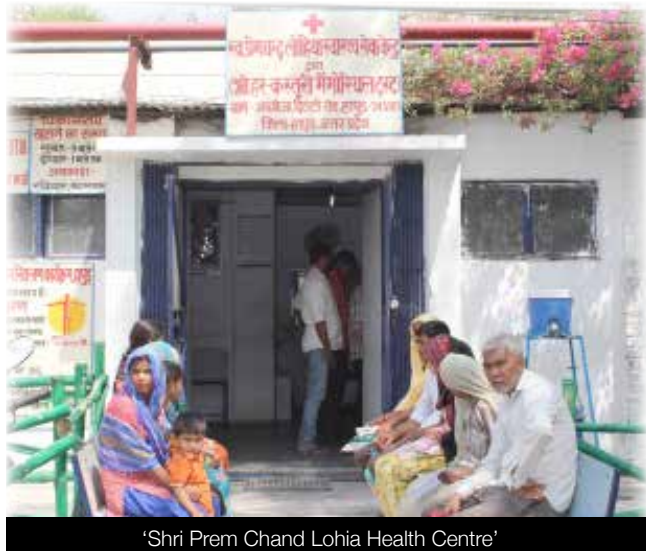
'Shri Prem Chand Lohia Health Centre'

treatment in about 72 villages in the district of Hapur, Uttar Pradesh.