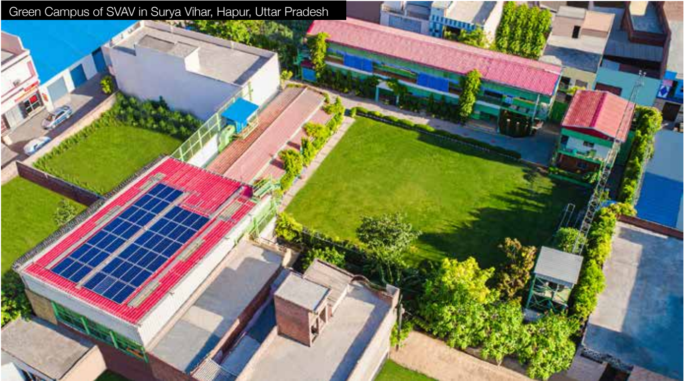
Green Campus of SVAV in Surya Vihar, Hapur, Uttar Pradesh