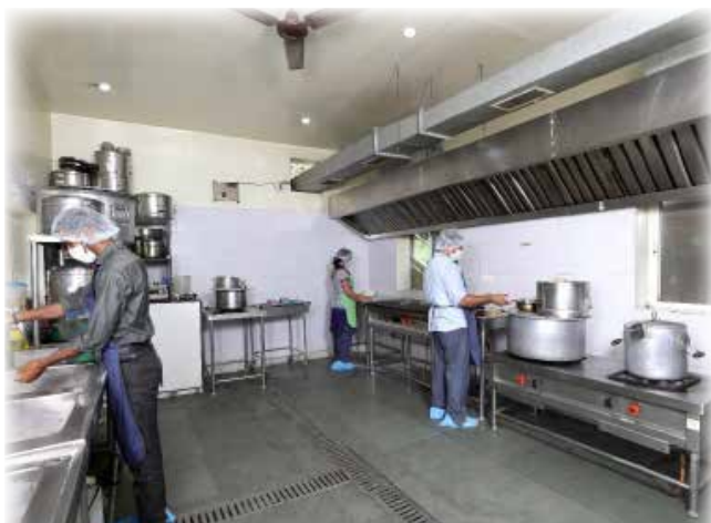
Image: Pakshala (food preparation house) for students' meal in SVAV campus

The Mid-Day Meal Programme have several key benefits. First, this meal is an important source of nutrition for many children who come from economically deprived families.