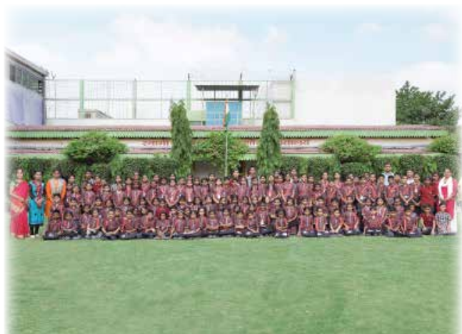
SVAV students with teachers

and a computer centre ensure students get access to updated modern education. The school campus also has infrastructure to support various kinds of games and sports facilities. The school takes a step beyond just education with provision of nutritious meals and good clothing for all its students.